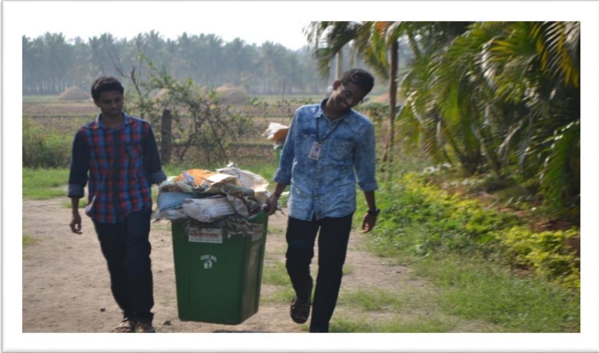
figure : Students disposing the waste in dust bins.