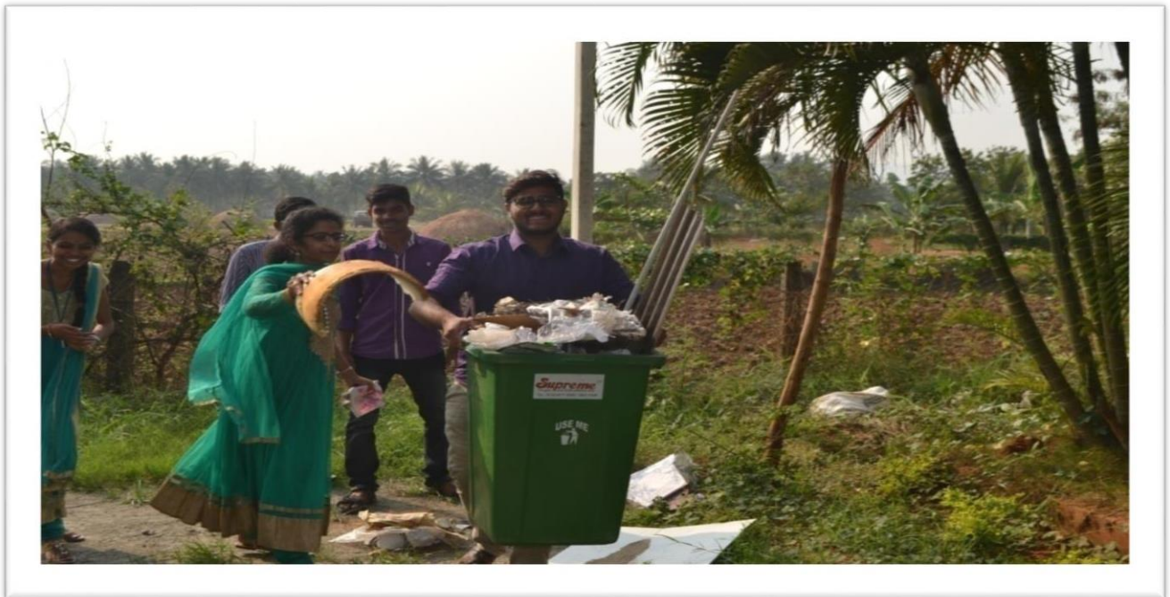
figure: Volunteers disposing the waste into the dust bins