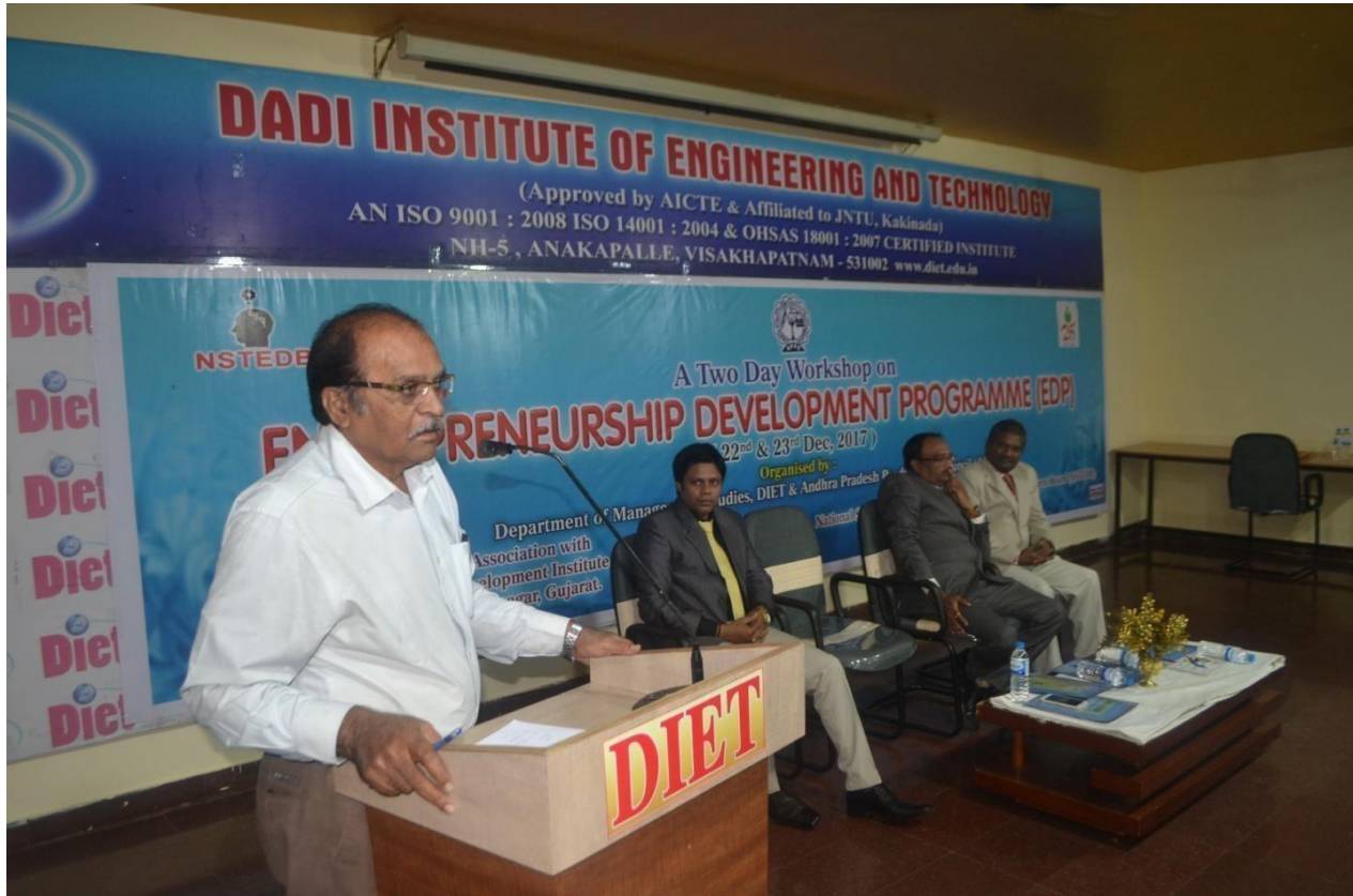
Fig 3: Resource Person addressing the Gathering on “ Entrepreneurship Development”

Mobile: +91 9963981111. Website: www.diet.edu.in . E-mail: info@diet.edu.in