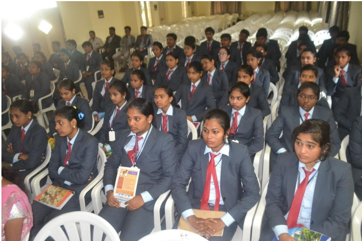
Fig 4: II MBA Students

Mobile: +91 9963981111, Website: www.diet.edu.in , E-mail: info@diet.edu.in