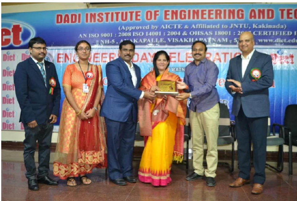
Fog 12: Felicitation of chief guest and guest of honor