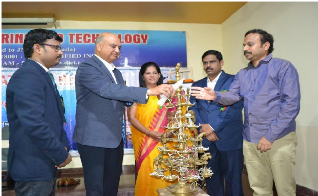
Fig 1:Engineer's Day event inaugurated with lightning of the lamp