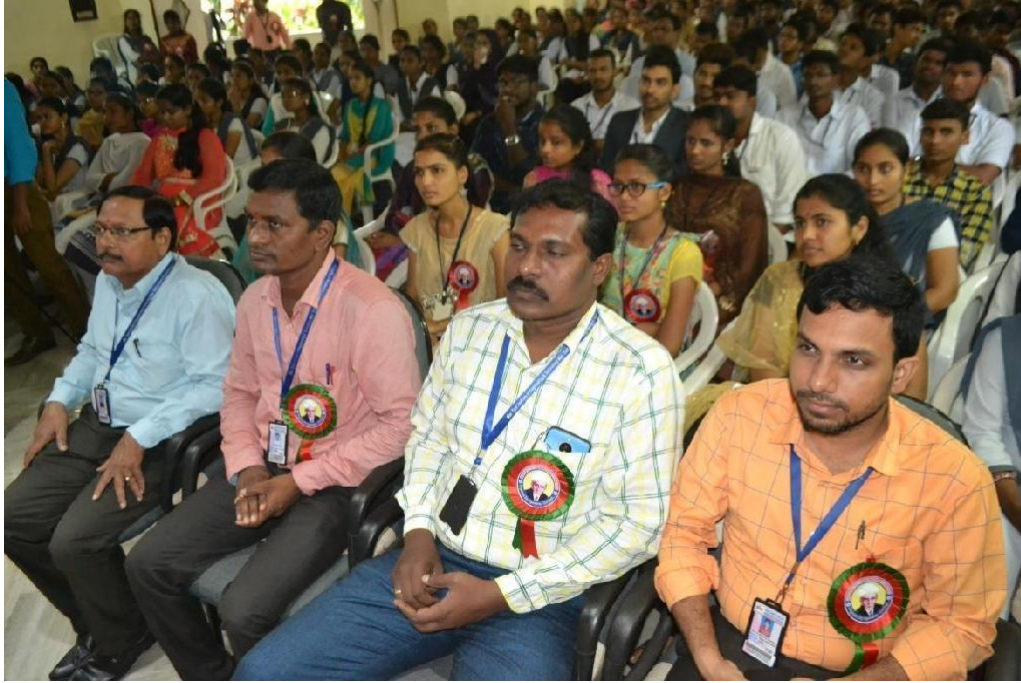
Fig 5: Students, Faculty and HODs of all the departments attended the event