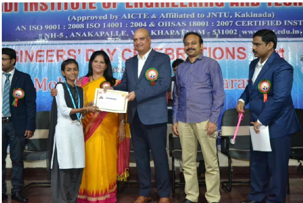
Fig 11: Academic toppers were awarded with 20 grams silver medal on this occasion

Merit students were awarded with 20 grams silver medals for showing academic excellence in the year 2018-19 and best library users were also awarded with cash prizes. The students who have actively participated in various events like Poster presentation, PPT, Model Expo, Quiz and Painting, Book Talk, Ganesh Idol making were given prizes on this occasion.