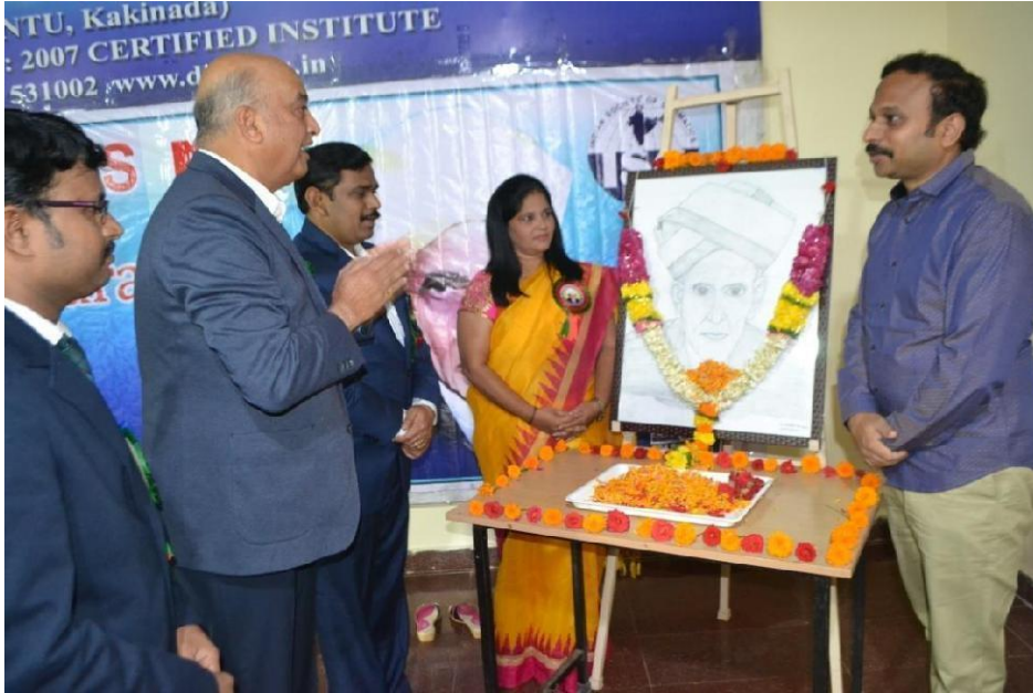
Fig 2: Dignitaries paying tribute to Sri Mokshagundam Visvesvaraya

An ISO 9001:2008, 14001:2004 & OHSAS 18001:2007 Certified Institute NH-5, Anakapalle, Visakhapatnam-531002