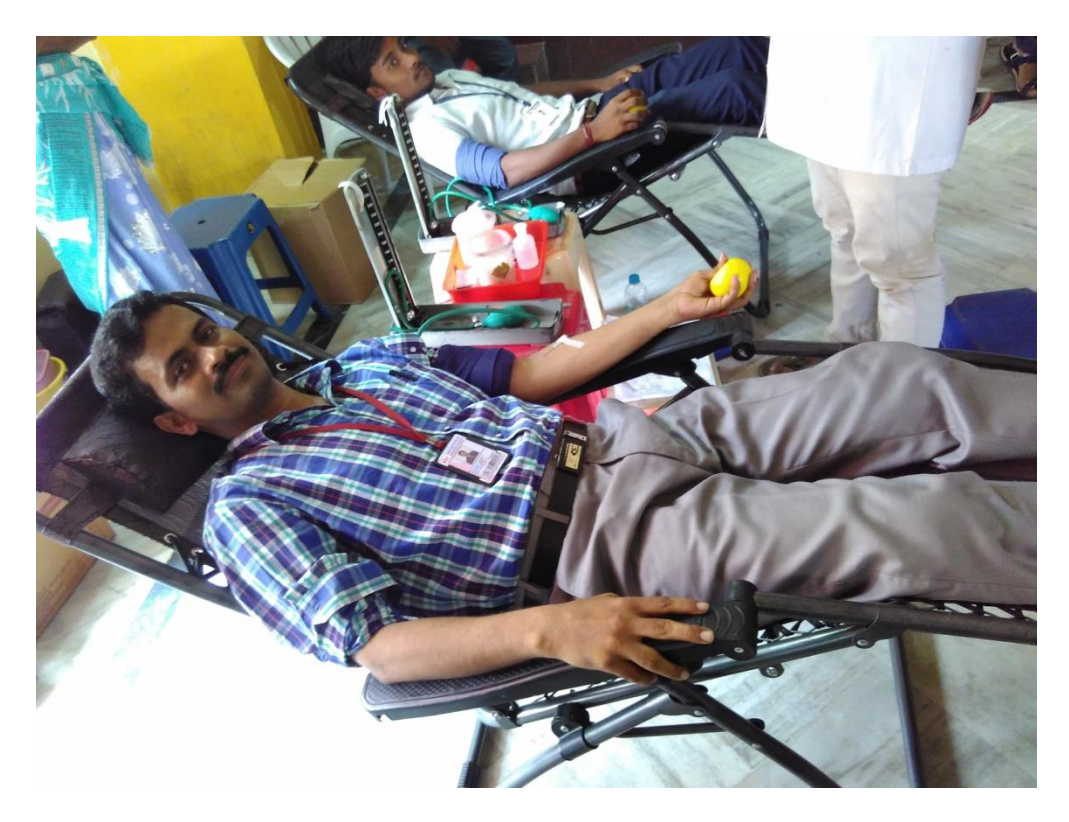
fig: student volunteers and staff mega blood donation camp