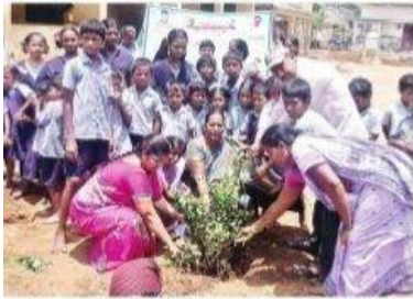
రామాపురంలో మొక్క నాటుతున్న ఉపాధ్యాయులు విద్యార్థులు