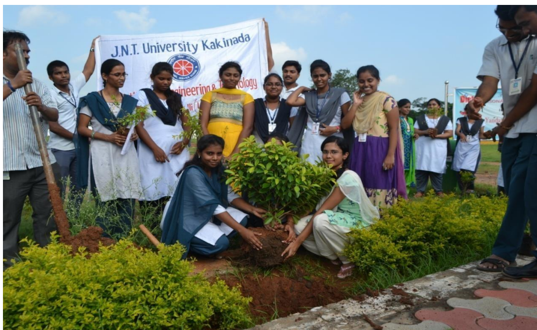
figure : Students planting plants in the college campus