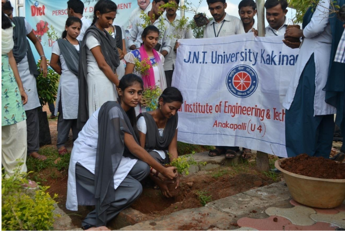
figure: Students involvement in the activity.

(Approved by A.I.C.T.E., New Delhi & Affiliated to JNTUK, Kakinada) An ISO 9001:2008; ISO 14001:2004 & OHSAS 18001:2007 Certified Institution NH-5, Anakapalle – 531002, Visakhapatnam, A.P. Mobile: +91 9963981111, Website: www.diet.edu.in , E-mail: info@diet.edu.in