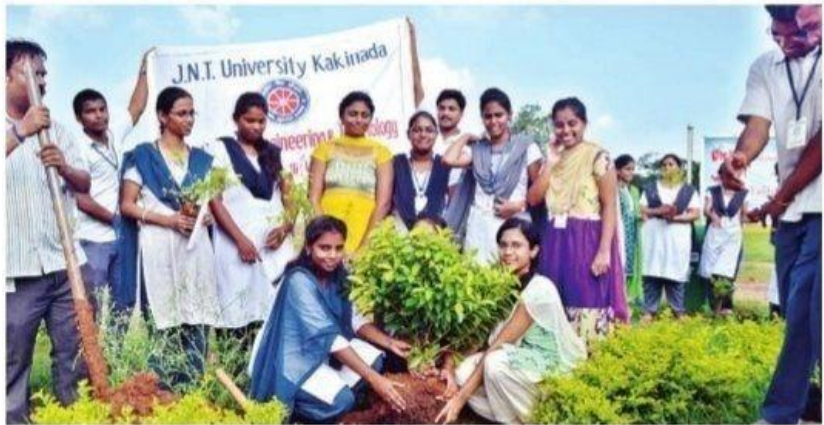
డైట్ కళాశాలలో మొక్కలు నాటుతున్న విద్యార్థులు