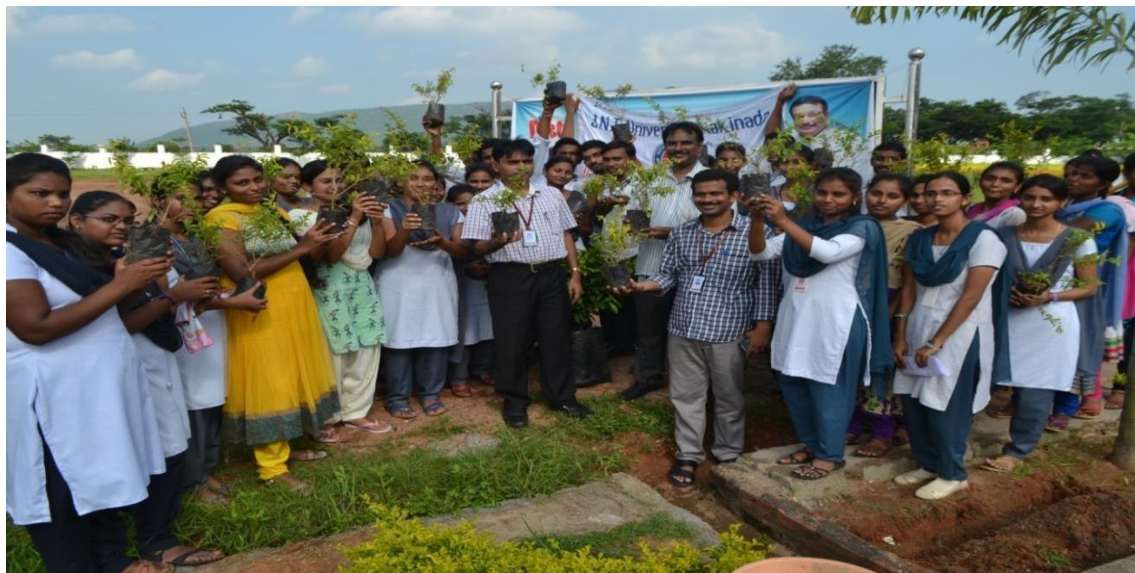
figure : Students and staff participation in the event