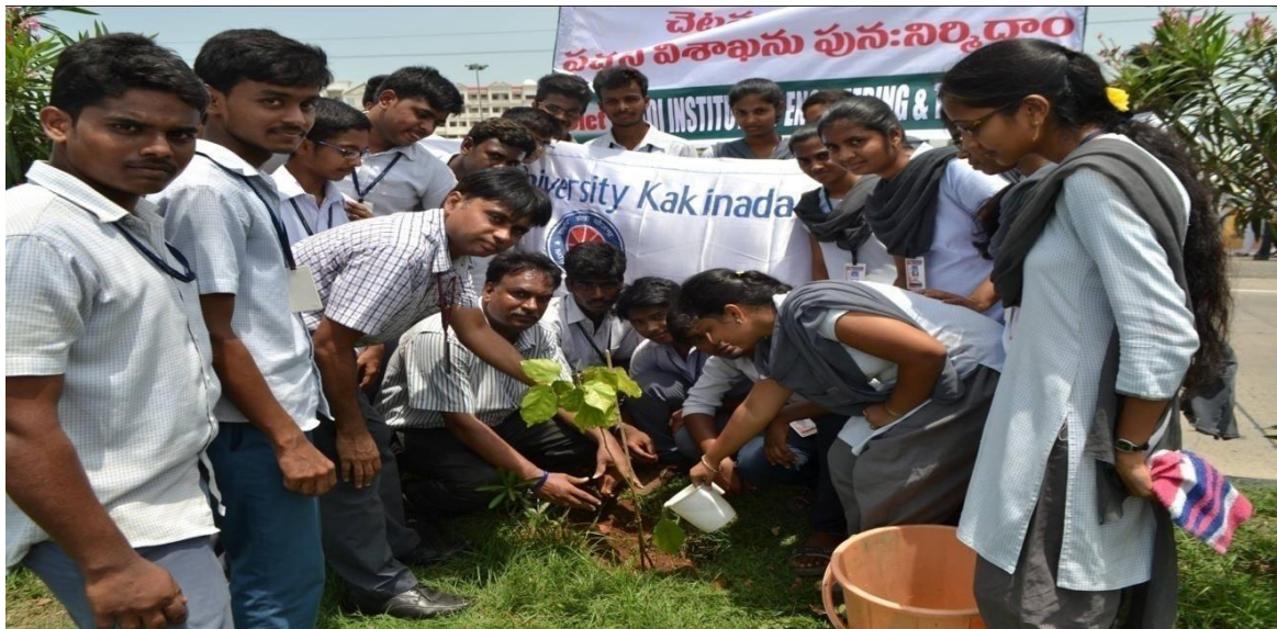
figure: Students and staff involvement in the activity.