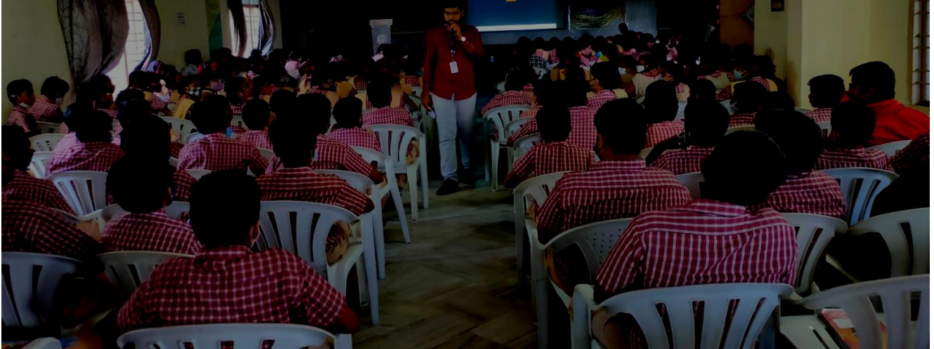
figure: students are interacting with skill India officials about impotence of modern technology

Mobile: +91 9963981111, Website: www.diet.edu.in , E-mail: info@diet.edu.in