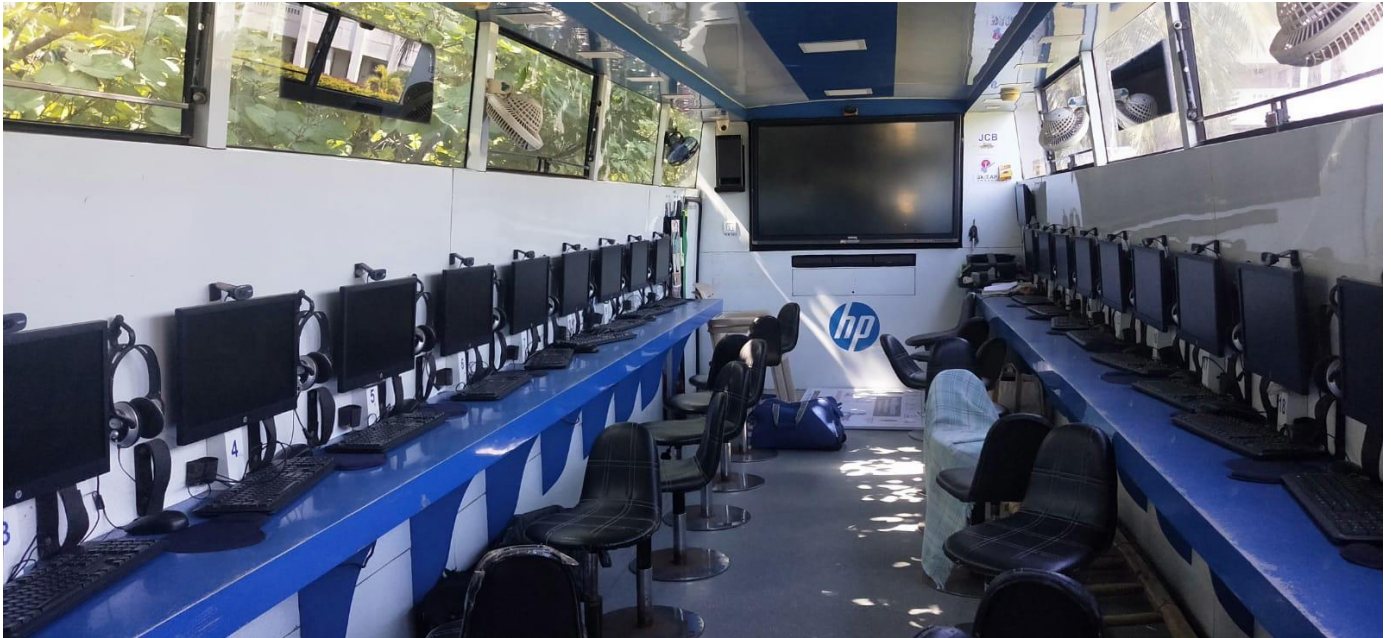
figure: Skill On Wheels Bus With High Hand Laptops To Train Students

Mobile: +91 9963981111, Website: www.diet.edu.in , E-mail: info@diet.edu.in