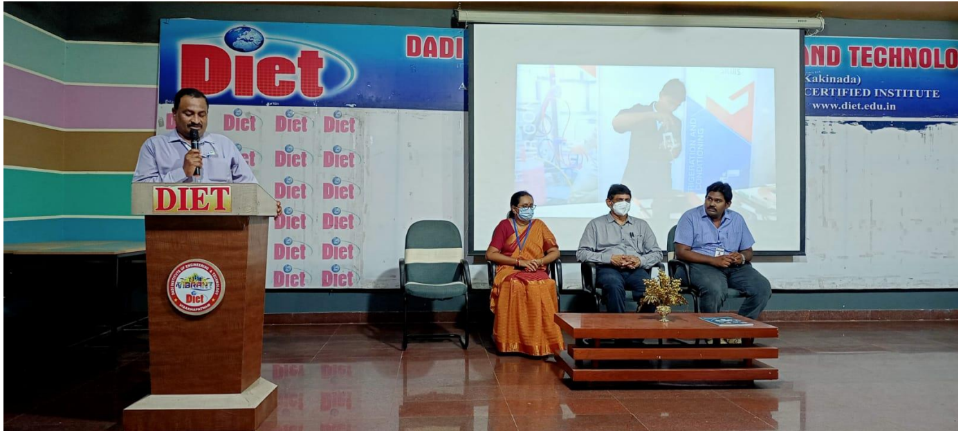
figure: Skill Team Officials Addressing The Gathering And Explaining The "Skill On Wheels" Impotence

Mobile: +91 9963981111, Website: www.diet.edu.in , E-mail: info@diet.edu.in