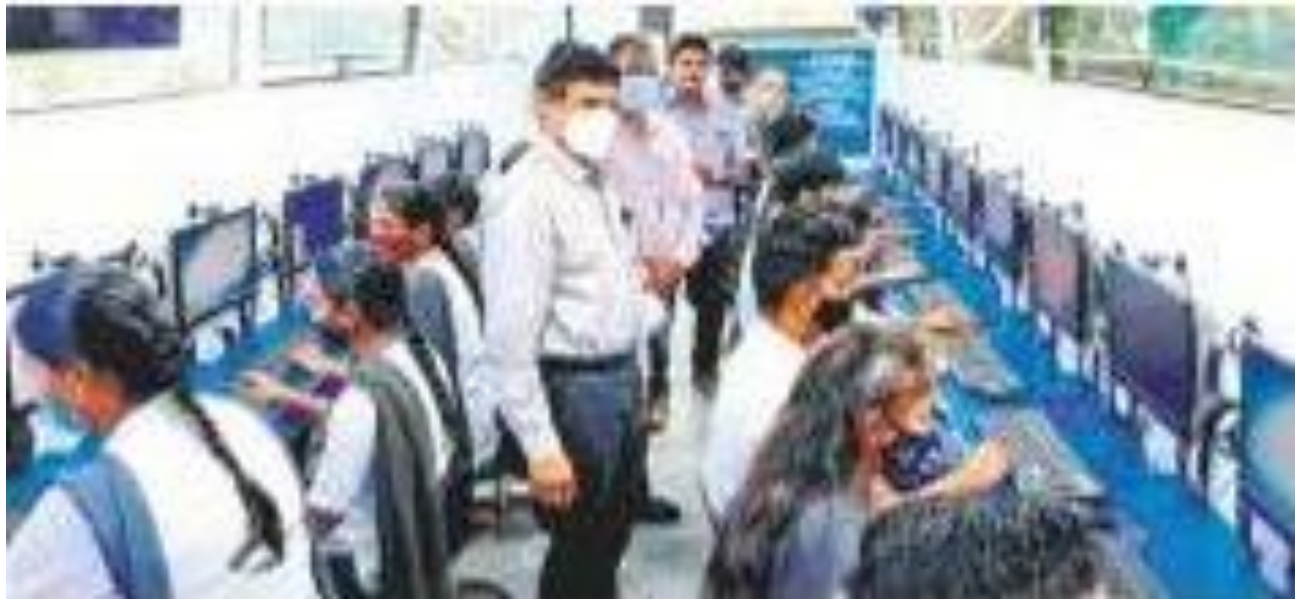
figure: Students Practicing With High Hand Laptop In Bus