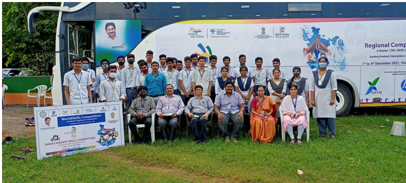
figure: Faculty and students Interaction with Skill India team with BUS

Mobile: +91 9963981111, Website: www.diet.edu.in , E-mail: info@diet.edu.in