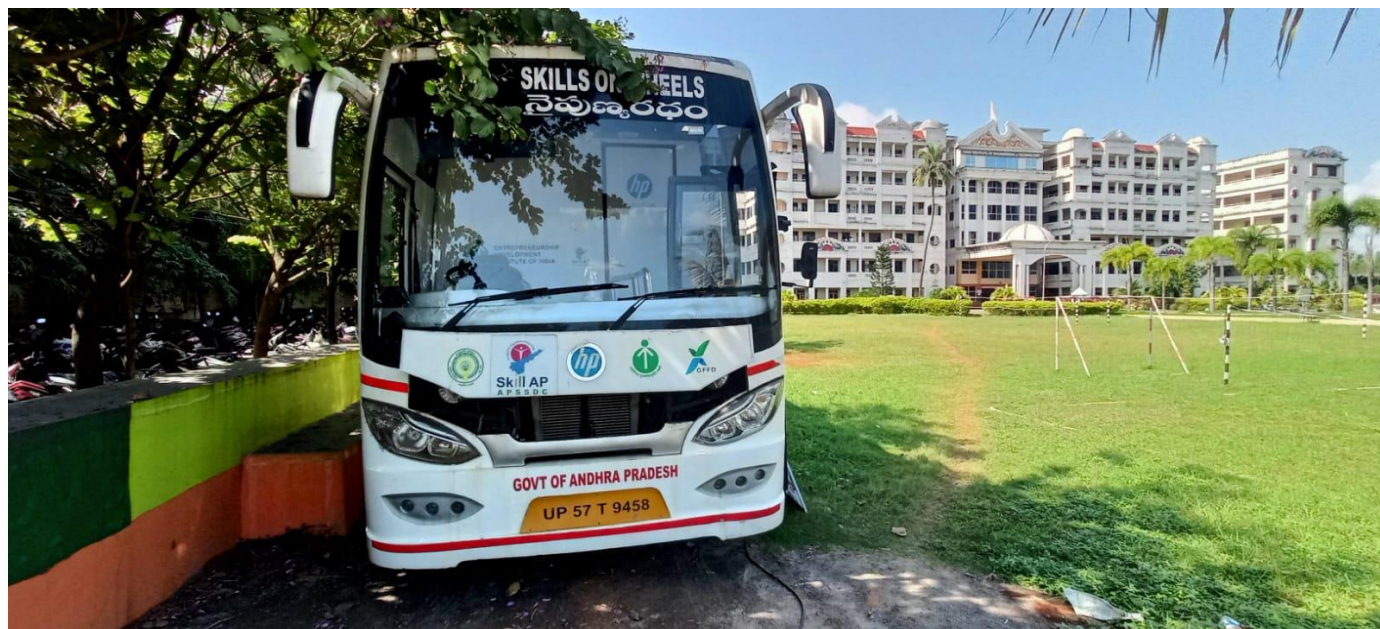
figure: Skills on Wheels bus arranged at DIET campus for visiting on 23 rd Nov, 2021

For this event "The main purpose of the mobile exhibition is to create awareness Campaign skill India modern technology for the students and also on industrial applications. to promote the importance of skill India Andhra Pradesh.