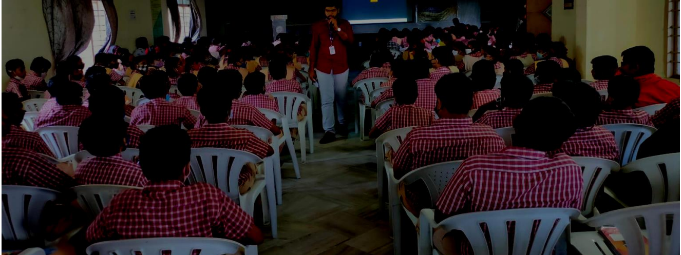
figure: students are interacting with skill India officials about impotence of modern technology

Mobile: +91 9963981111, Website: www.diet.edu.in , E-mail: info@diet.edu.in