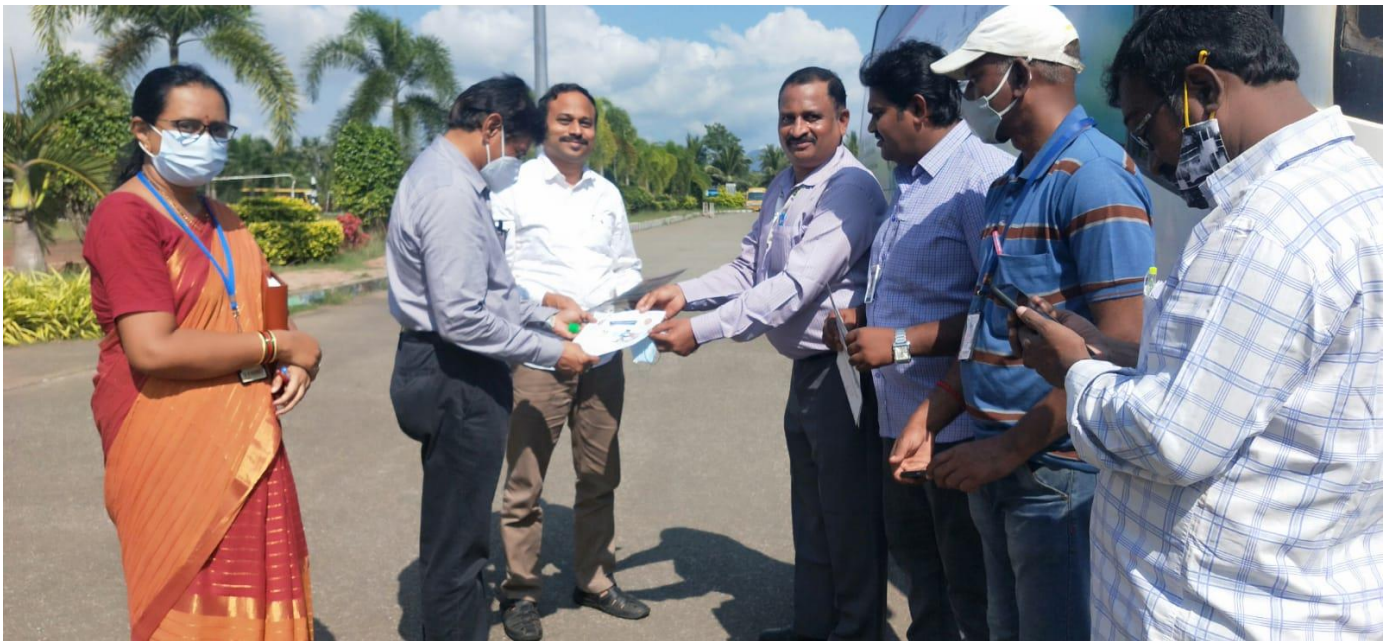
figure: Inauguration of Exhibition by Sri Dadi Ratnakar, Chairman