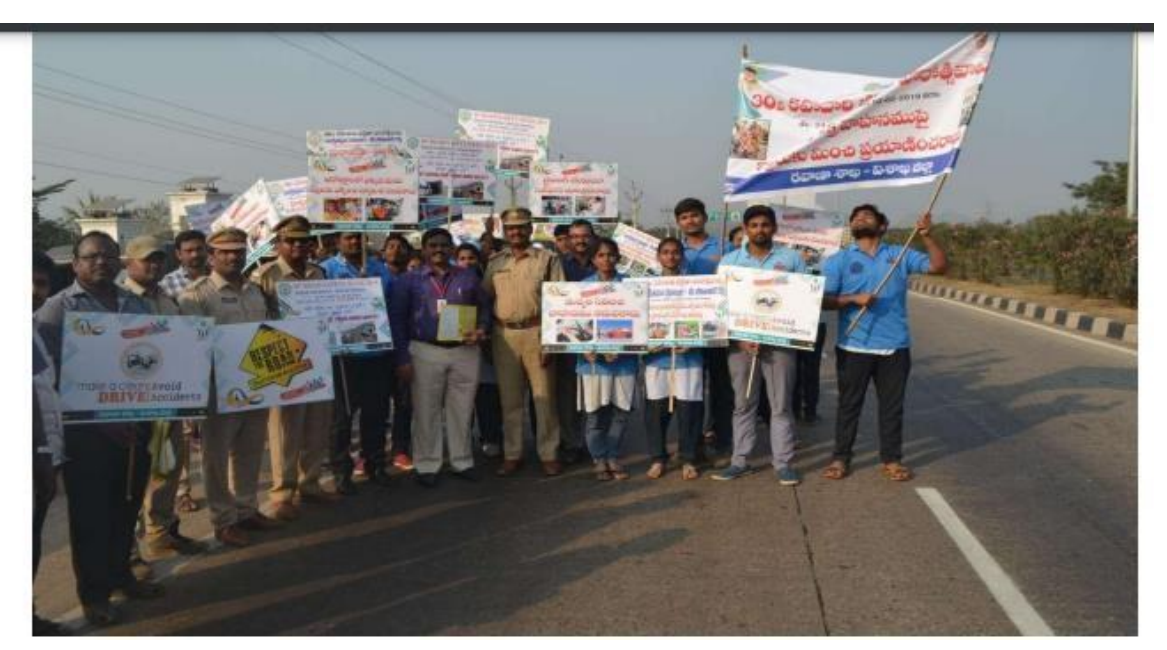
Fig: NSS students creating awareness on road safety