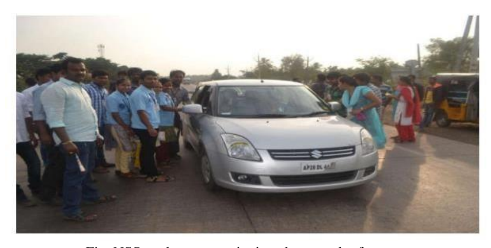
Fig: NSS students campaigning about road safety

Volunteers would stress the importance of wearing helmet, seat belt, and slow driving etc.