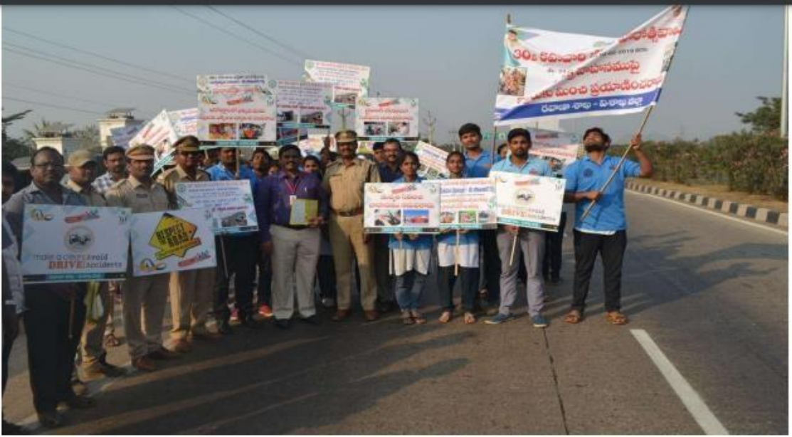
Fig: NSS students creating awareness on road safety