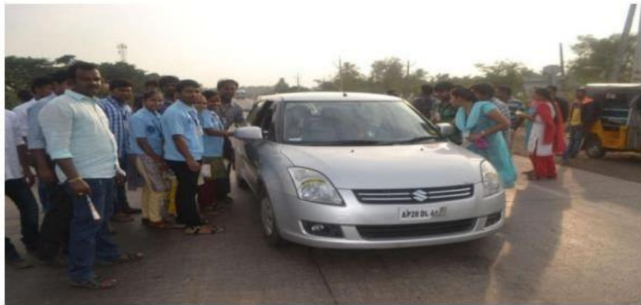
Fig: NSS students campaigning about road safety

Volunteers would stress the importance of wearing helmet, seat belt, and slow driving etc.