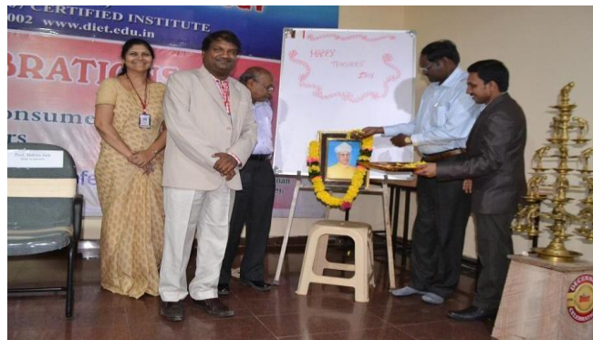
Fig 1: Garlanding to Dr. Sarvepalli Radhakrishnan