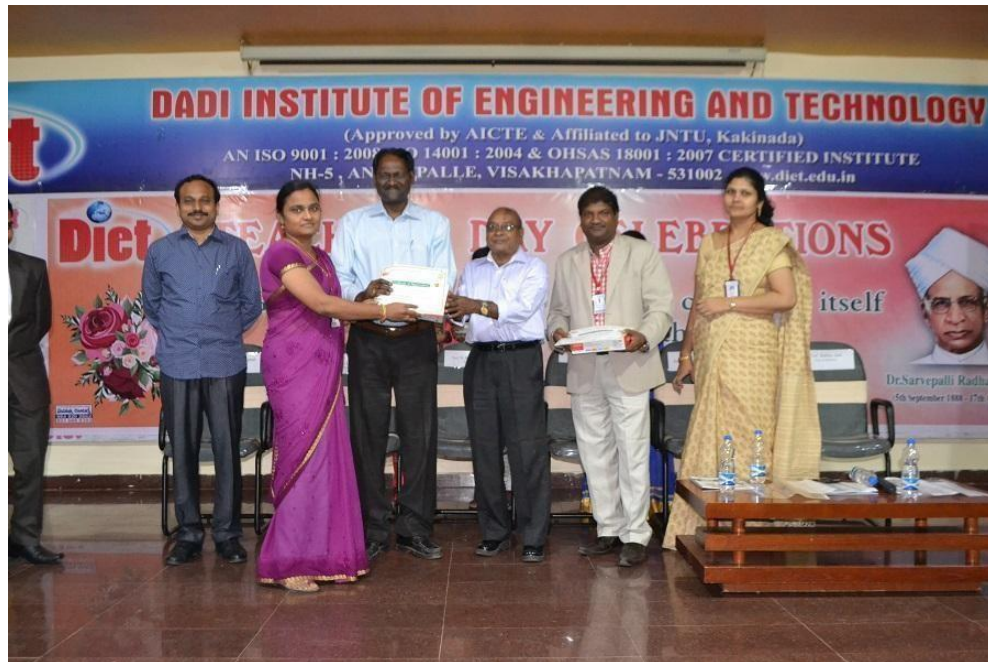
Fig 3:Distribution of Award and certificates to the Faculty by Guests on the Dais.