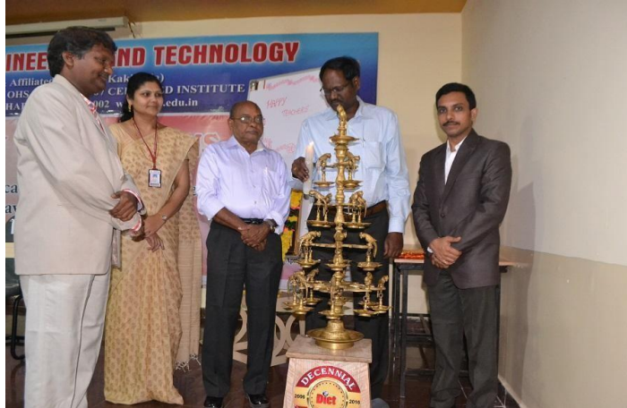
Fig 2:Lightning of lamp by dignitaries on the dais

Phone: 08924-221111; E-Mail: info@diet.edu.in