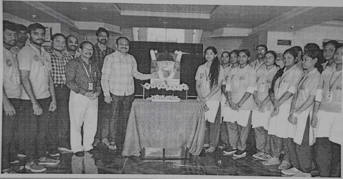
DIET NSS Unit celebrated National Education day .In the eve of National Education day.Chairman sir and principal sir paying tributes to Maulana Abul Kalam Azad.

November 11 th of every year is celebrated as National Education Day. India celebrates the birth anniversary of Maulana Abul Kalam Azad who was not only a noted scholar, poet and a revolutionary journalist but also remembered for his invaluable contributions in the Indian freedom struggle.