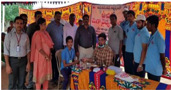
figure: Medical camp at Tarakarama Colony Adopted villages