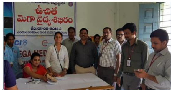
figure: Medical camp conducted at