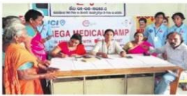
వైద్య శిబిరంలో సేవలు అందిస్తున్న వైద్యులు