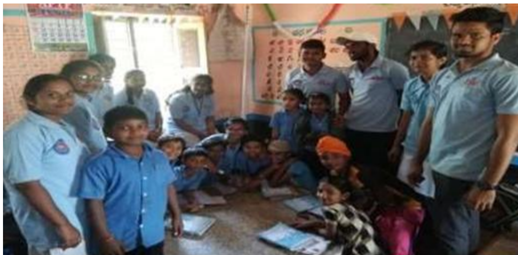
Fig2 : Student Volunteers interacted with school children's on Adopted Village Maredupudi

Our NSS Student volunteers are conducted the indoor games to the school children's to find the participations levels and interacted with school conduct the awareness session on education