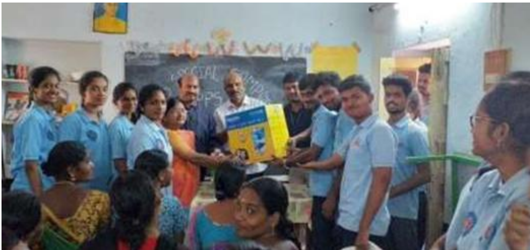
Fig2 : Student Volunteers Donating water purifier filter on Adopted Village school at Maredupudi