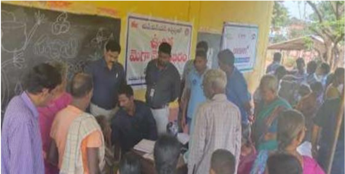
Fig1 : Student Volunteers conducted Eye camp in akkireddiplaem with KIM's docotors