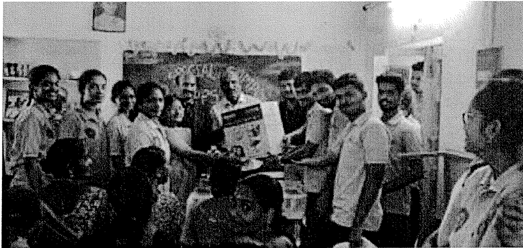
Fig2 : Student Volunteers Donating water purifier filter on Adopted Village school at Maredupudi