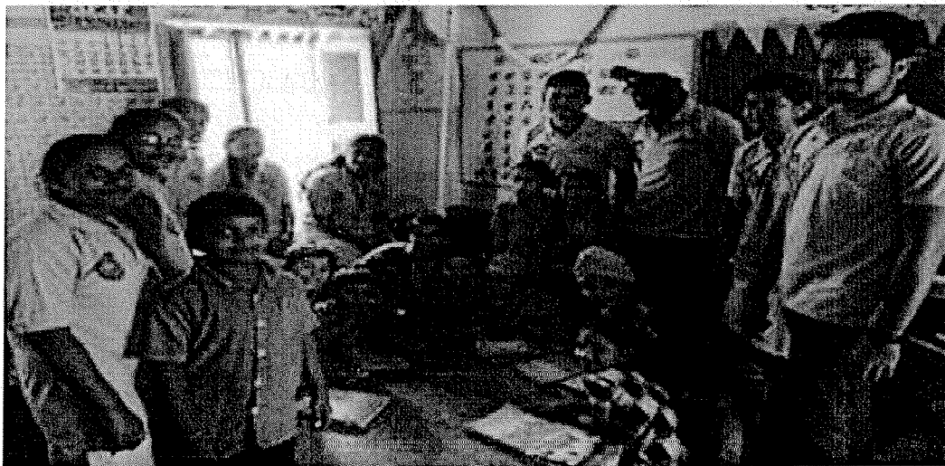
Fig2 : Student Volunteers interacted with school children's on Adopted Village Maredupudi

Our NSS Student volunteers are conducted the indoor games to the school children's to find the participations levels and interacted with school conduct the awareness session on education