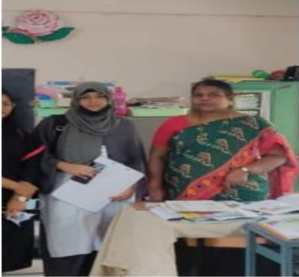
Figure: Awareness on Regulation of Higher Education System conducted by NSS unit