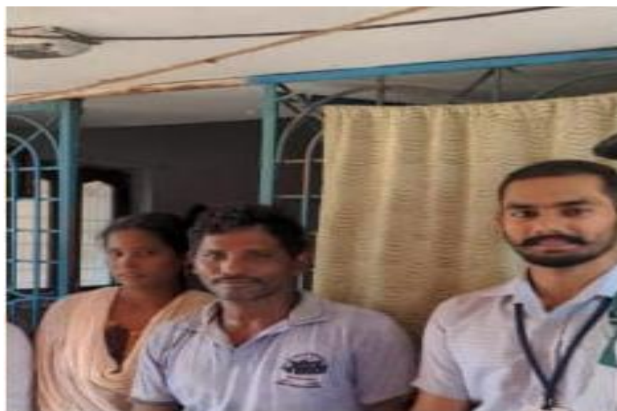
Figure: Awareness on Regulations of Higher Education System conducted by NSS unit