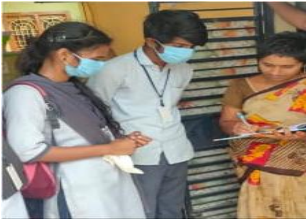
Figure: Awareness Camp conducted by NSS unit