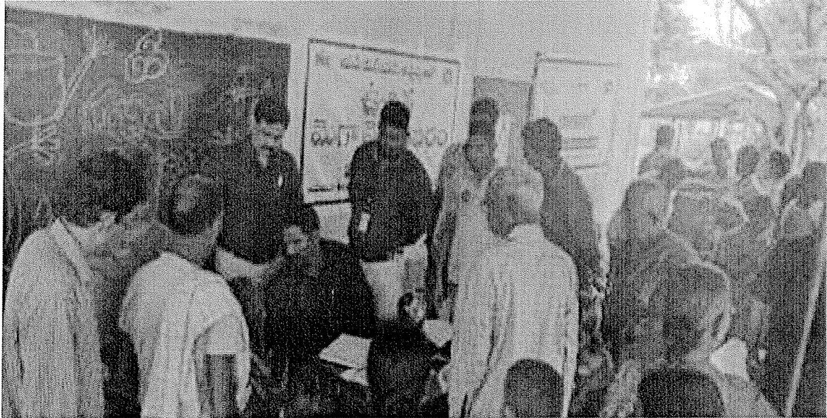
Fig1 : Student Volunteers conducted Eye camp in akkireddiplaem with KIM's docotors