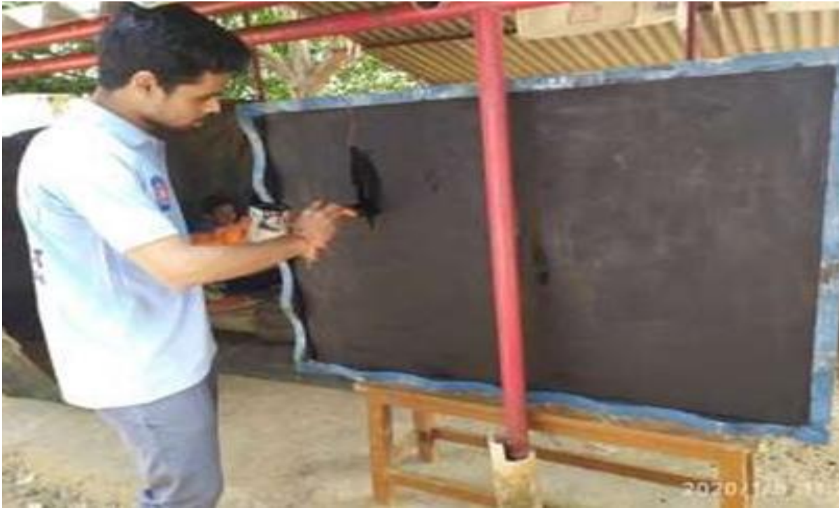
Fig3 : Student Volunteers decorated the school campus with paintings in the building and black painting on class boards school in akkireddiplaem