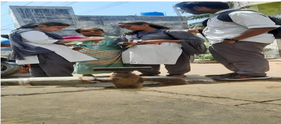
Figure: Awareness session on "Water Facilities and Drinking water Availability"