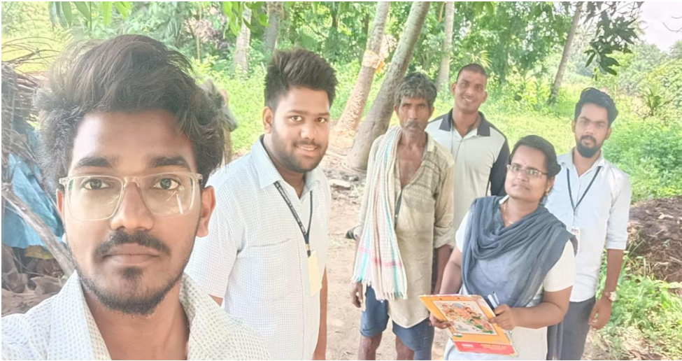
Figure: Awareness session on "Water Facilities and Drinking water Availability"