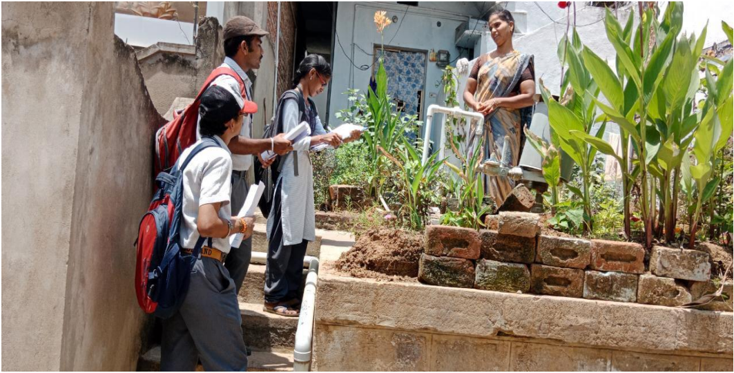
Figure: Awareness session on "Water Facilities and Drinking water Availability"