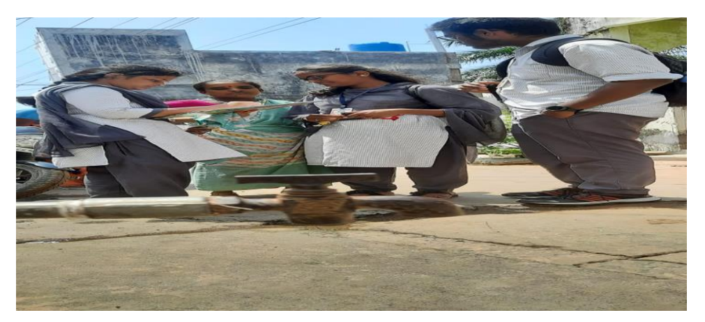
Figure: Awareness session on "Water Facilities and Drinking water Availability