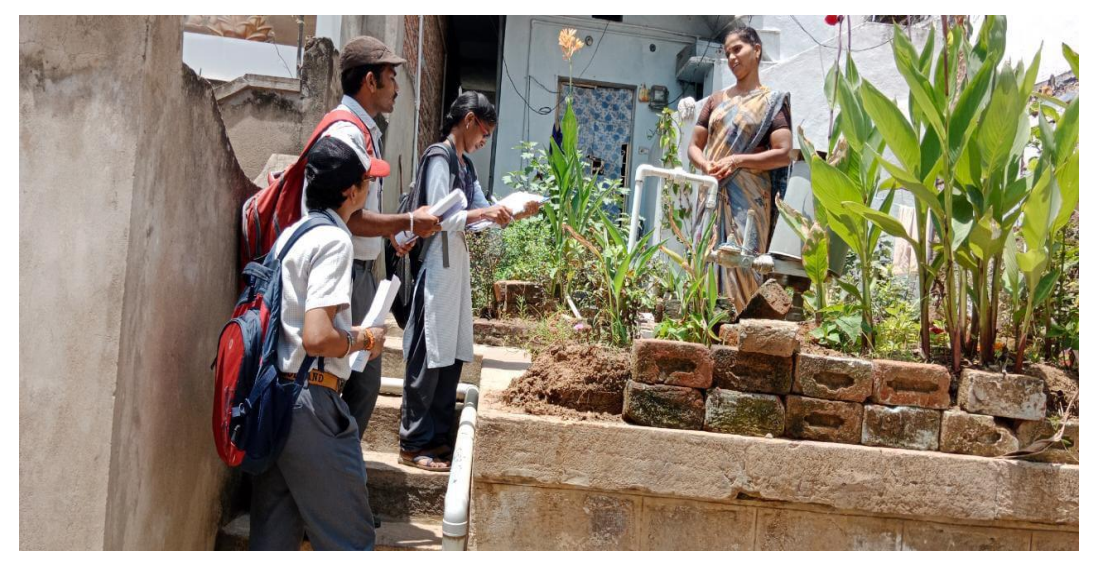
Figure: Awareness session on "Water Facilities and Drinking water Availability