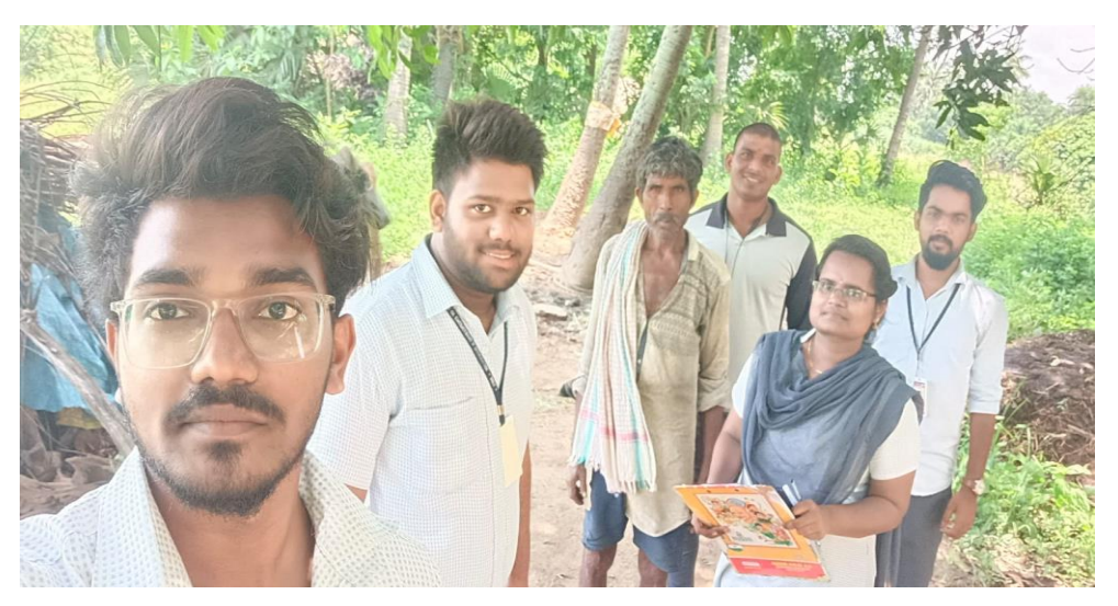
Figure: Awareness session on "Water Facilities and Drinking water Availability