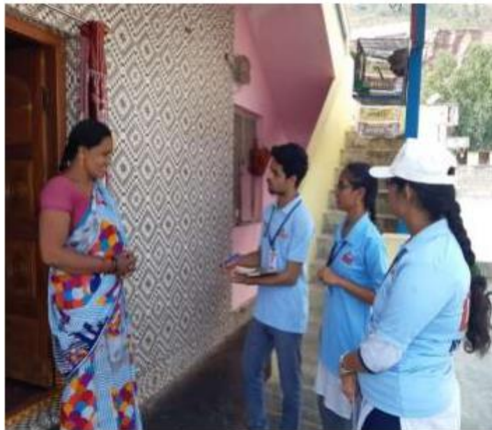
Fig:3-NSS Student Volunteers creating awareness on energy conservation