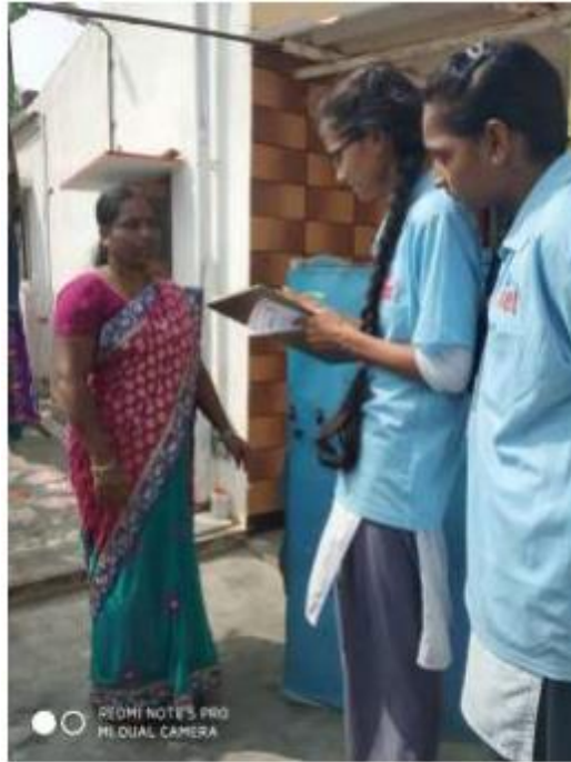
Fig:2-NSS Student Volunteers creating awareness on energy conservation