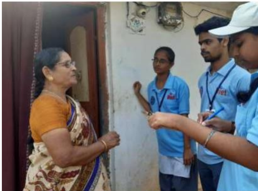
Fig:1-Nss Volunteers Enquiry The Electrical Usage