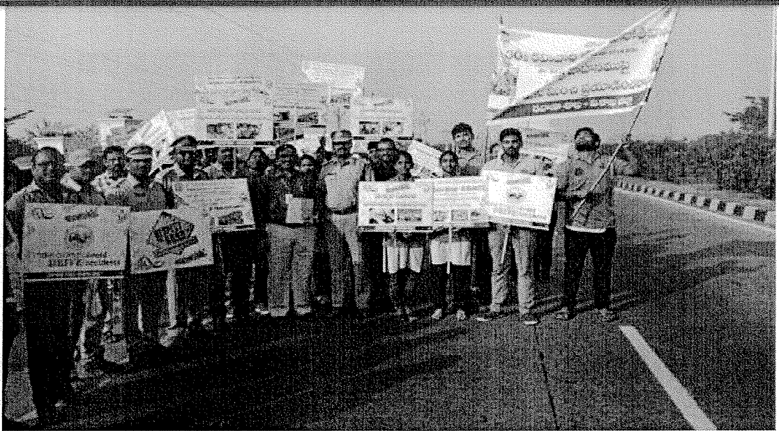
Fig: NSS students creating awareness on road safety

Programme Officer National Service Scheme (Unit No. AP 16-108) Dadi Institute of Engg & Technology Anakapalle - 521 012