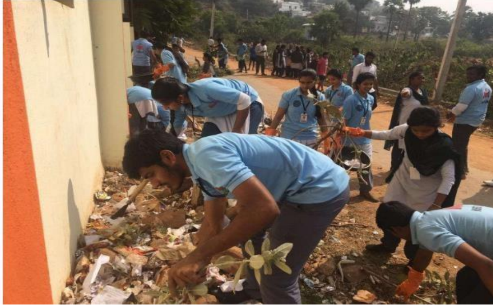
Fig 13. DIETNSS volunteers actively involving in the cleaning of neighboring villages