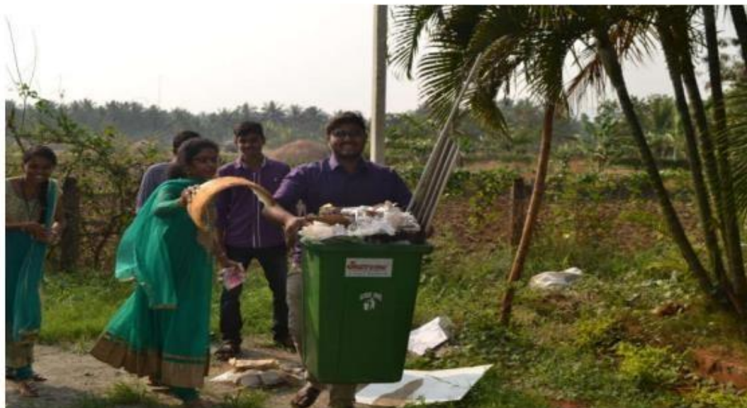
Fig 14. DIET NSS Students Volunteers conducted outdoor cleanliness programme in its adopted villages like Akkireddypalem and Maredupudi.