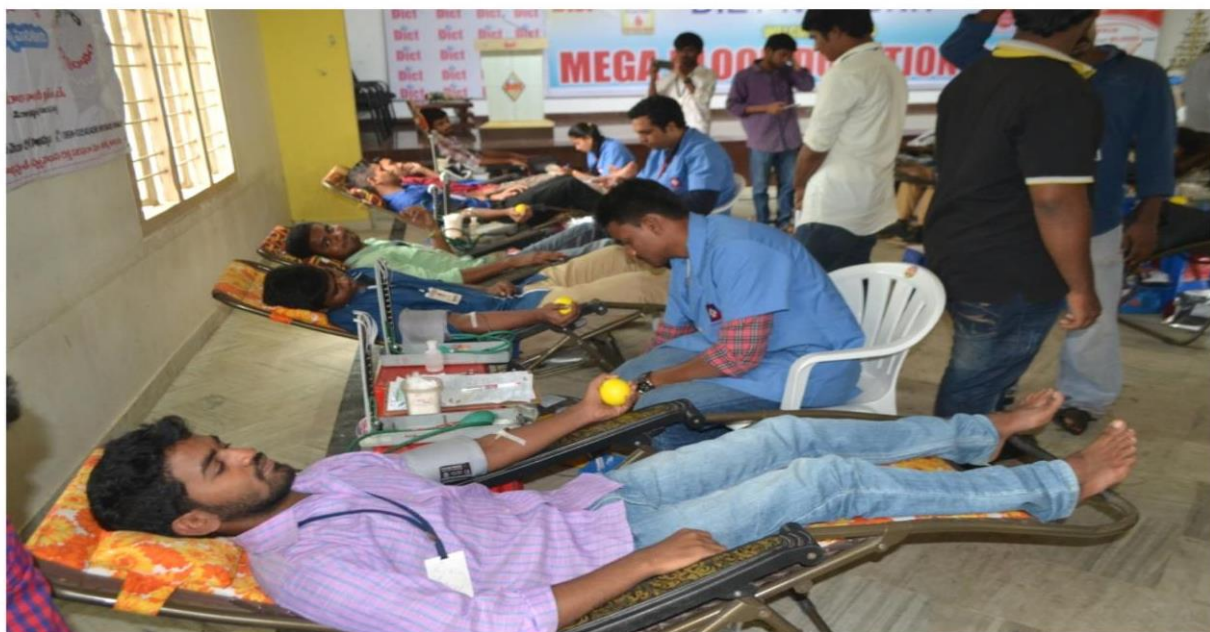
figure: Donating Blood by the DIET Faculty and Students.