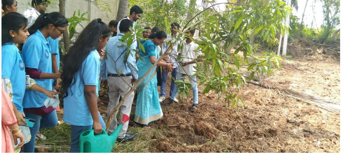
Departments hod's are planted trees

Mobile: +91 9963981111, Website: www.diet.edu.in , E-mail: info@diet.edu.in