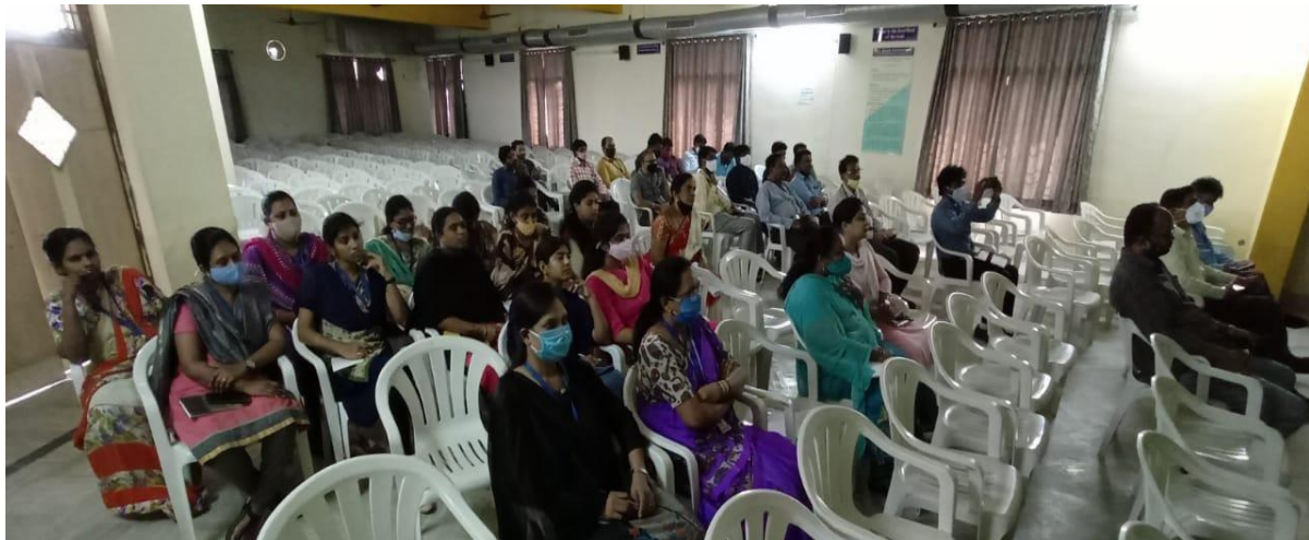
Fig. 2 Participants for research talk