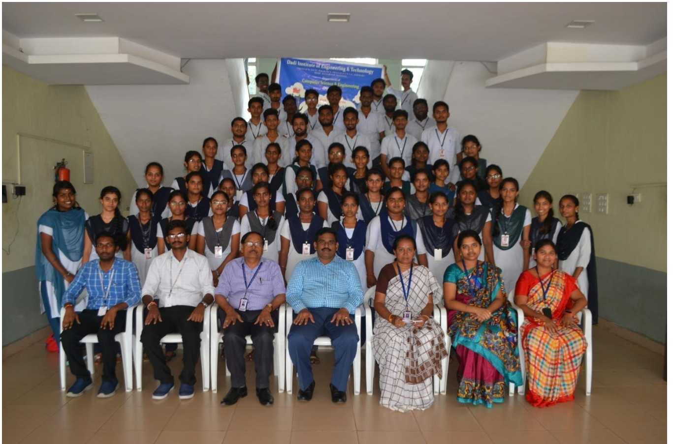
Fig 5. Participants Group Photo with Associate Cloud Architect Trainers From APSSDC(Amazon web services)