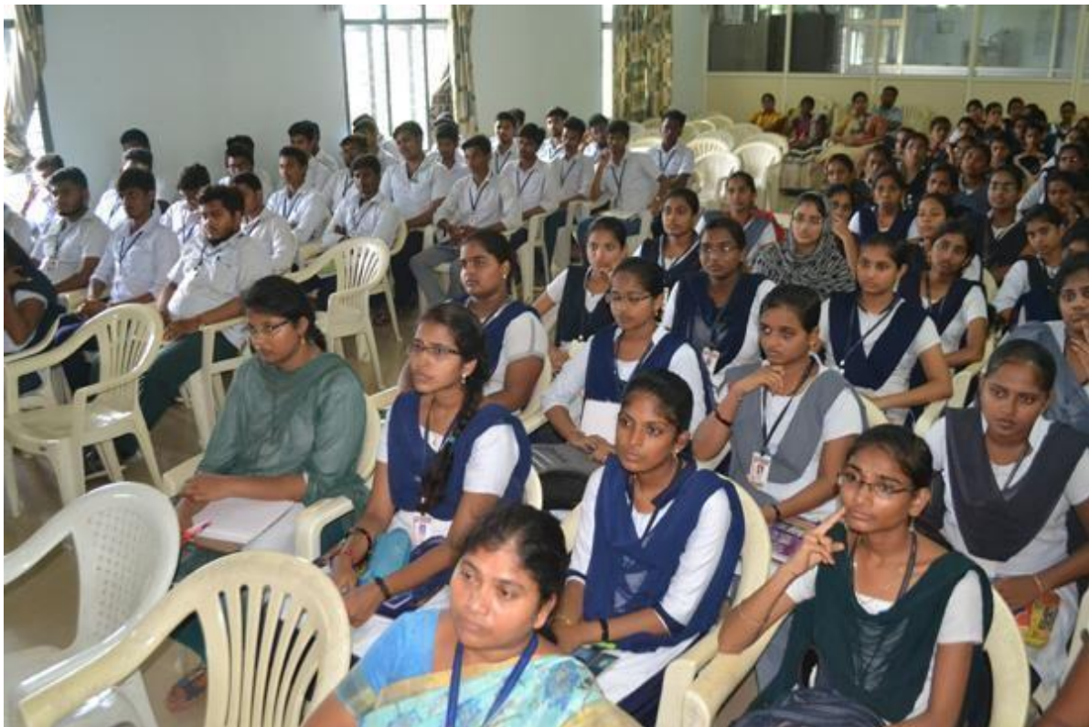
Fig 4 Students Gathering At The Inauguration Of Associate Cloud Architect Workshop(Amazon web services)