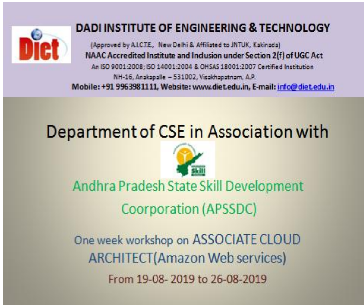
Fig 1: Brochure

Andhra Pradesh State Skill Development Corporation provides specialized training to the Students of Polytechnic, Engineering colleges etc., in various disciplines in different courses by conducting six day Workshops.