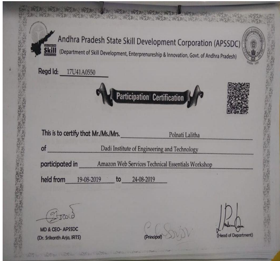
Fig 6: Participation Certificat