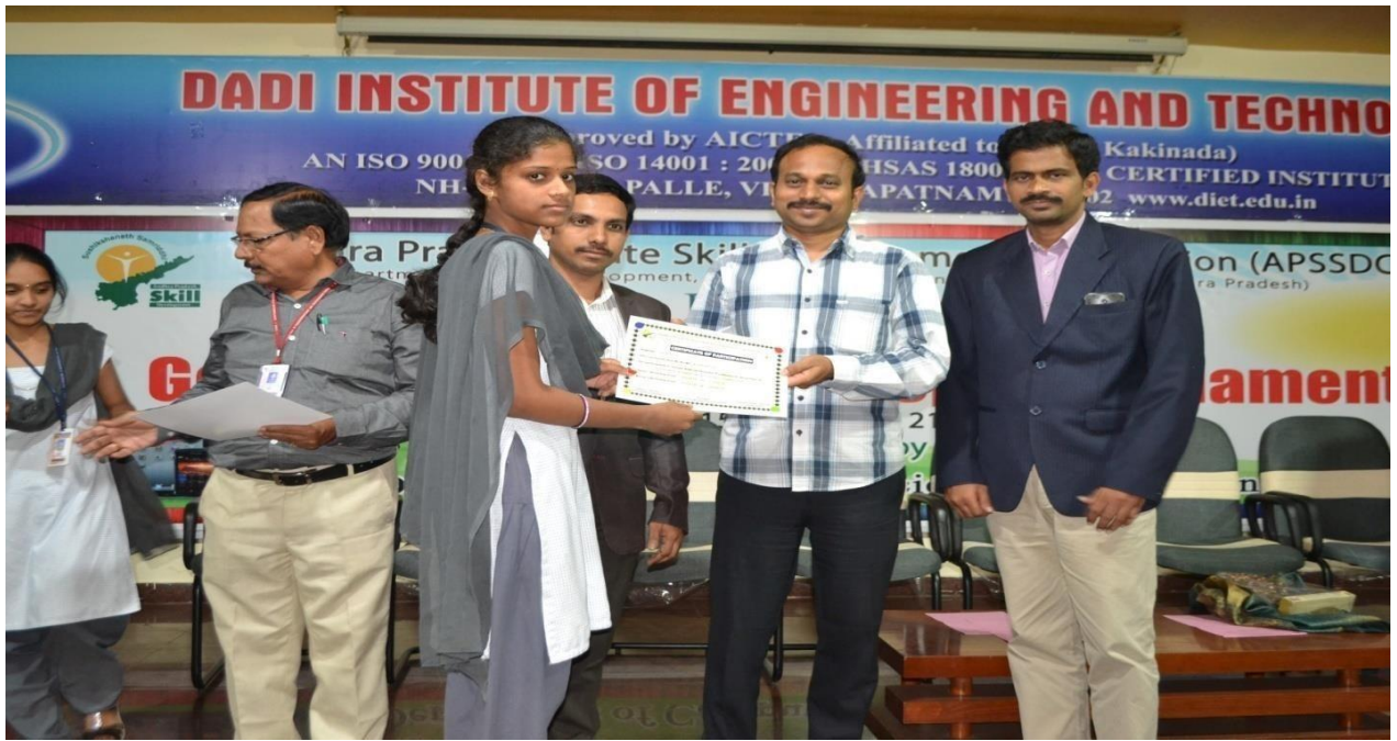
Certificate Distribution to all participants