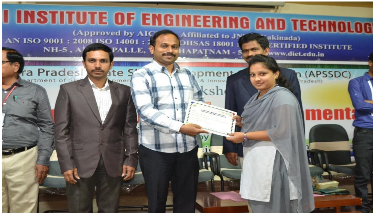
Certificate Distribution to all participants