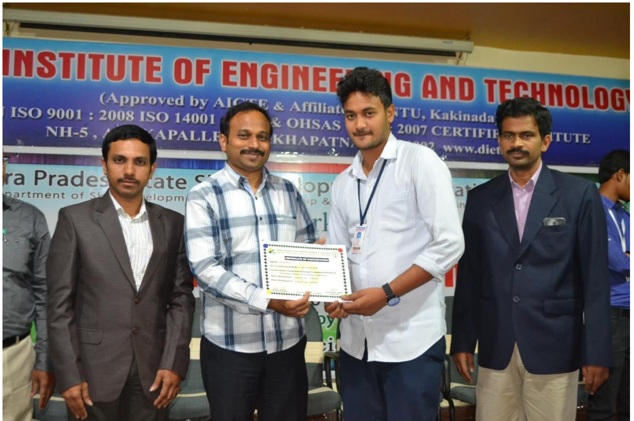
Certificate Distribution to all participants