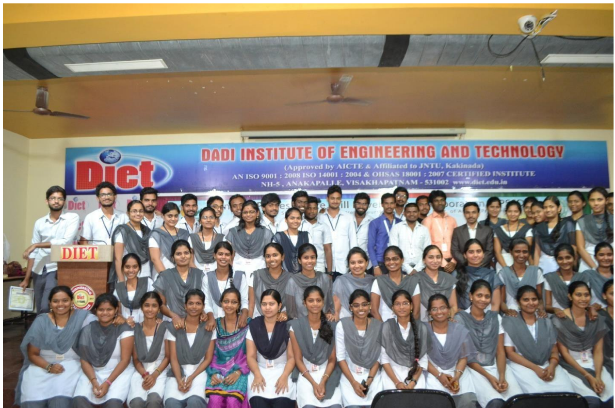
Participants Group photo with Trainers from APSSDC.